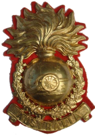
Other Ranks Australian Field Artillery Hat Badge (Militia) 1903 – 1922 (Keith Glyde Collection)