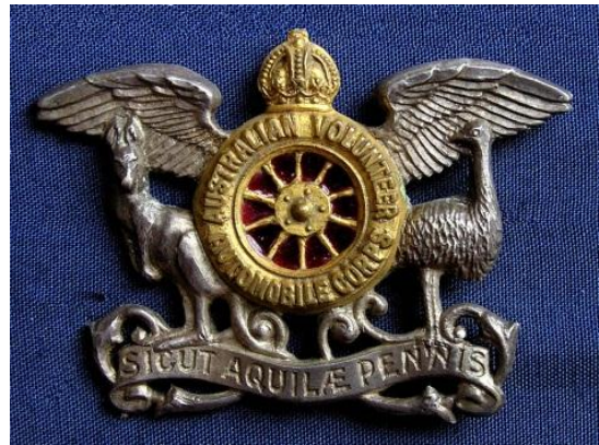
Australian Volunteer Automobile Corps hat badge