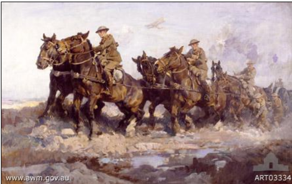
“Bringing up the Guns” – 1917 (Australian War Memorial ART03334)