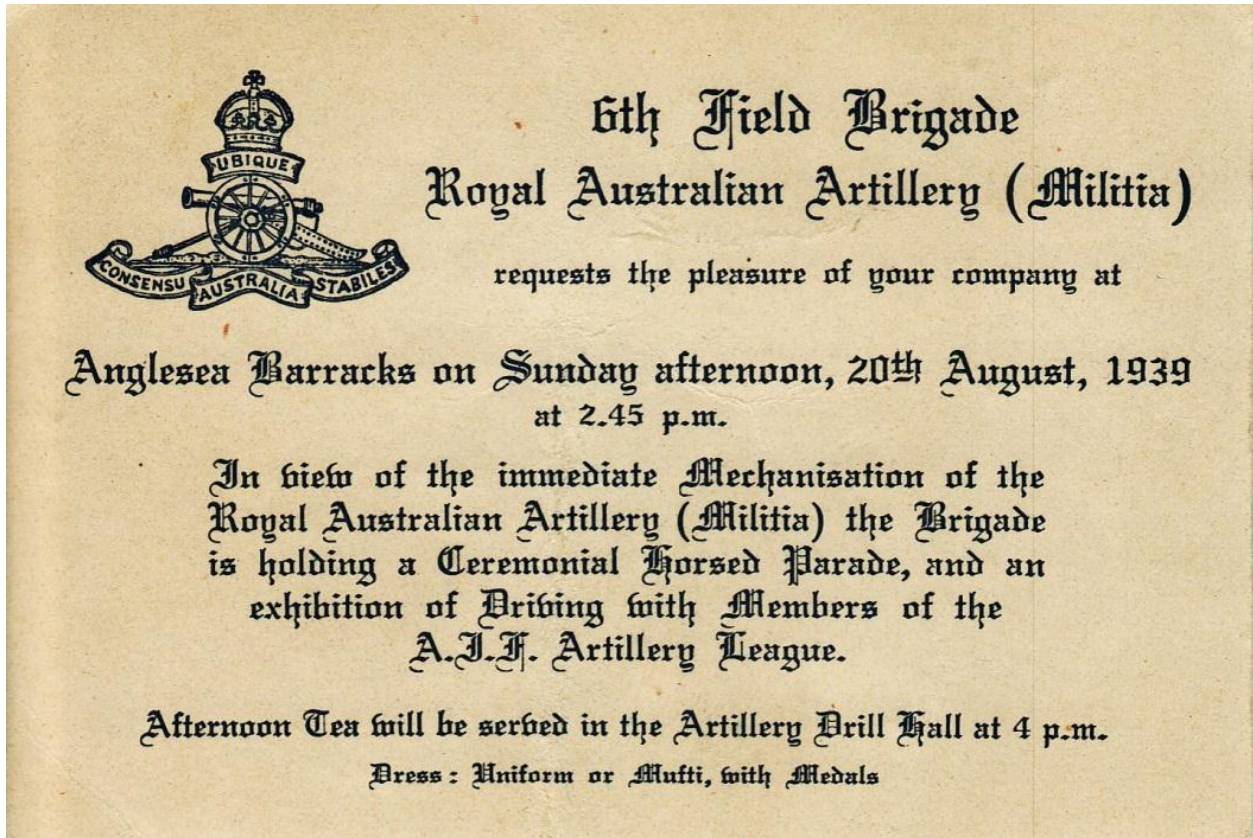
6 th Field Brigade, RAA, invitation card to attend a Ceremonial Horsed Parade held prior to mechanization on Sunday, 20 th August, 1939.