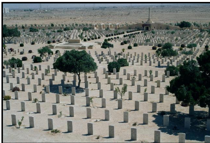
Some who never had the chance to grow old! Part of El Alamein War Cemetery

A number of the northern Tasmanian members of the Royal Australian Artillery Association - and several of their wives and carers - made the trip to Hobart for the Anniversary service at the Cenotaph and the medallion presentation at Government House. Some decided to travel by the Army bus whilst others came down in private transport.