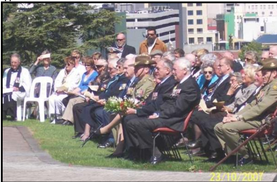
A small section of the crowd waiting for the commemorative service and memorial wreath-laying ceremony to commence.